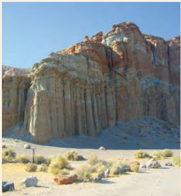
Location: Red Rock Canyon SP parks.ca.gov

Surrounded by majestic mountains and buttes, California City offers breathtaking sunrises and sunsets. During the winter months there