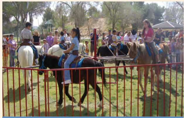
See what California City has to offer: CaliforniaCity.com

California City offers a variety of recreational and family activities including camping, flying, golfing, fishing, and hiking. These desert areas provide one of the last remaining places in California to enjoy off road riding.