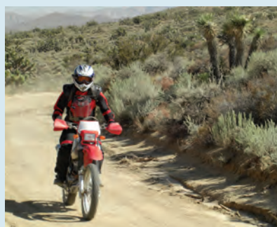
Location: Jawbone Visitors Center Jawbone.org

Jawbone Station Visitors Center , which is open seven days a week, 9 am to 5 pm. (760) 373-1146