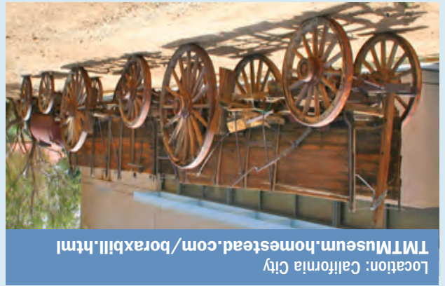
Location: California City TMTMuseum.homestead.com/boraxbill.html