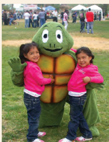
Location: Central Park, Calif. City Dates: First weekend in May DesertTortoiseDays.com

The festival then continues in beautiful Central Park, where vendors and entertainers provide an entire weekend of traditional family fun.