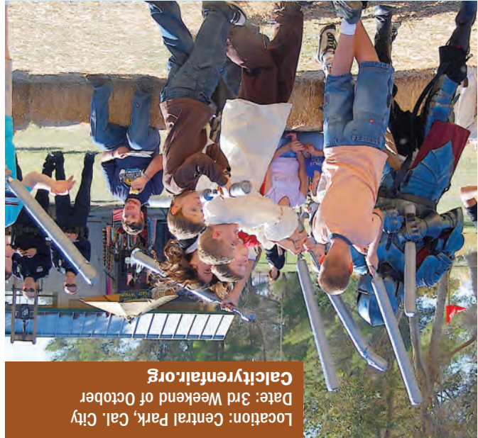
Location: Central Park, Cal. City Date: 3rd Weekend of October Calcityrealfair.org