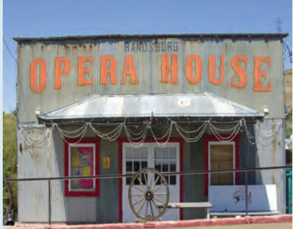
Location: Randsburg Date: 3rd weekend in September Randsburg.com

Randsburg Western Days features live bluegrass & county music, The Red Rock Canyon Gang, The Old West Mounted Lawmen, cowboy poetry, antiques & collections, pancake breakfast, car & tractor show, arts & crafts, and hay rides.