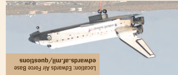
Location: Edwards Air Force Base edwards.af.mil/questions

Most tours include visiting the Air Force Flight Test Center Museum, a windshield tour of the Edwards flightline and a tour of the NASA Dryden Flight Research Center. Celebrate Armed Forces Day in Rosemond on the last Saturday of September.