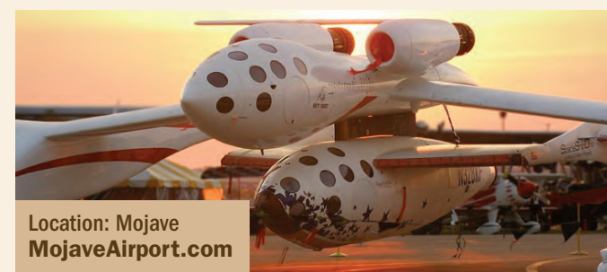
Location: Mojave MojaveAirport.com

7 The Mojave Air and Space Port has emerged as the leading aerospace test center for commercial operations in North America. Tours are available. (661) 824-2433